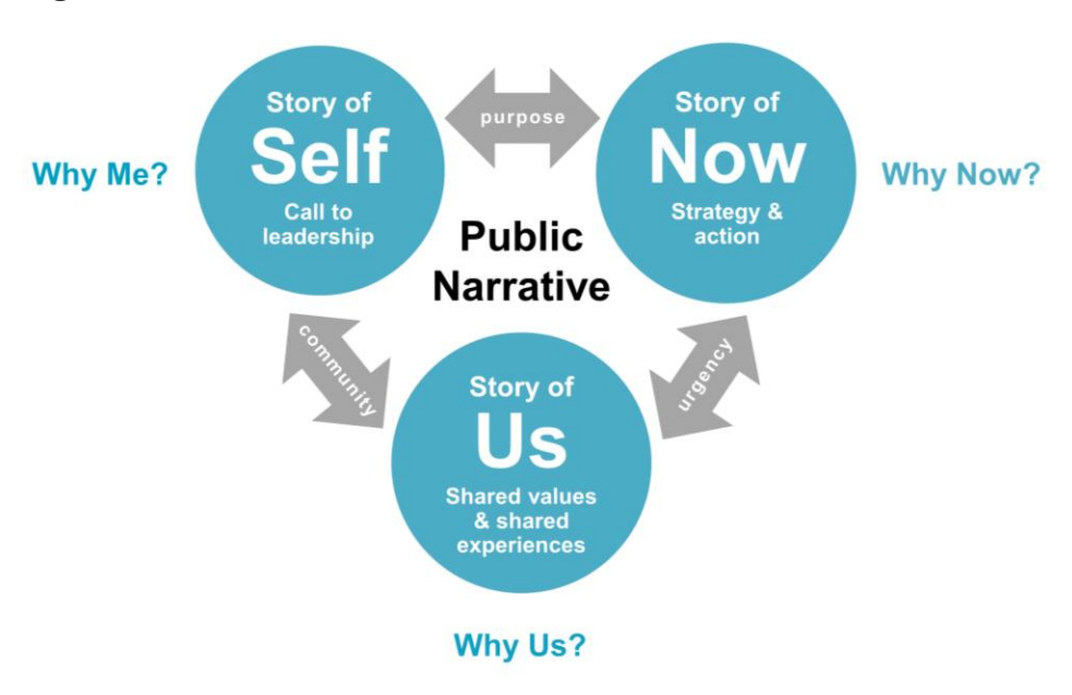
Figure 2. Public Narrative

Source: Ganz M. What Is Public Narrative: Self, Us & Now (Public Narrative Worksheet).<sup>21</sup> Adapted with permission.