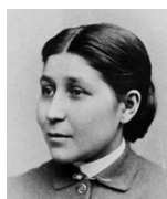
Dr. Susan La Flesche Picotte

Nebraska physician who attracted worldwide attention for being the first physician to use an airplane to perform emergency surgery.