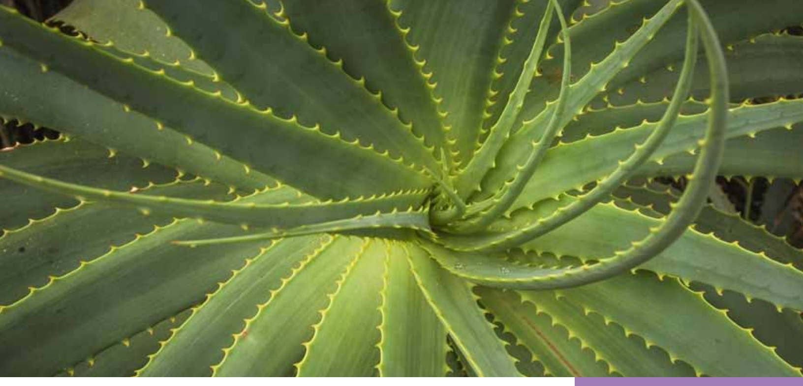
Table of <u>contents</u>