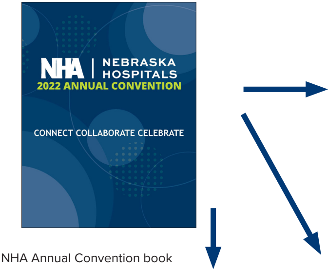
NHA Annual Convention book

With hundreds of attendees, the NHA Annual Convention provides optimal exposure for your company in many ways!