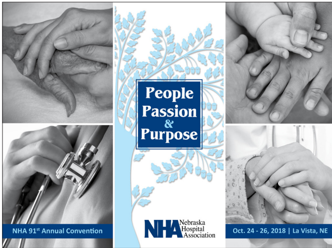
NHA Annual Convention book

With hundreds of attendees, the NHA Annual Convention provides optimal exposure for your company in many ways!