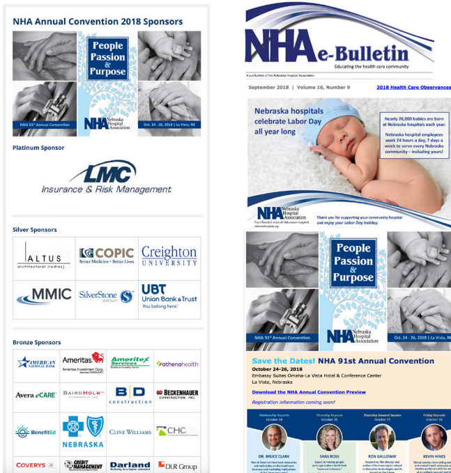
NHA Convention web page & e-newsletter

Sponsorship of keynote speaker, breakout session, etc.