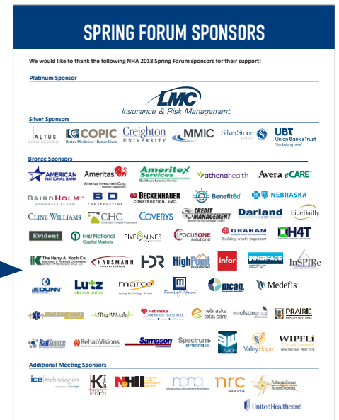
NHA Spring Forum & Golf Tournament brochure