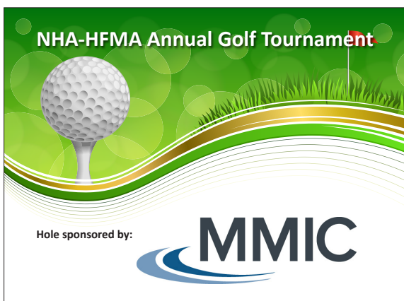
Golf Tournament hole sponsor sign (12" x 18")