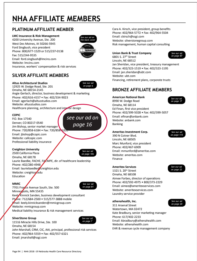
NHA Health Care Resource Directory ad examples (Ads shown not intended as preferential treatment of advertiser.)