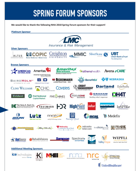
NHA Spring Forum & Golf Tournament brochure