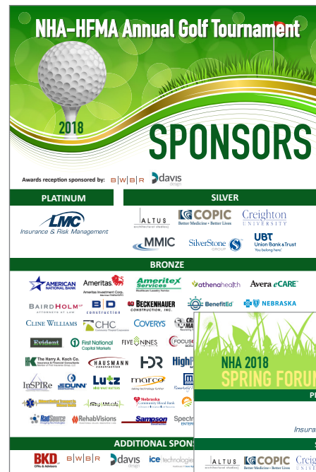
Golf sponsor sign & Forum sponsor sign (24" x 36")