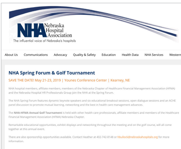
NHA Spring Forum web page