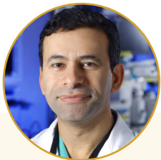
Wednesday Keynote | October 25 Marty Makary, MD

Surgeon and health care expert who focuses on common-sense reforms for health care and transparency of medical information.